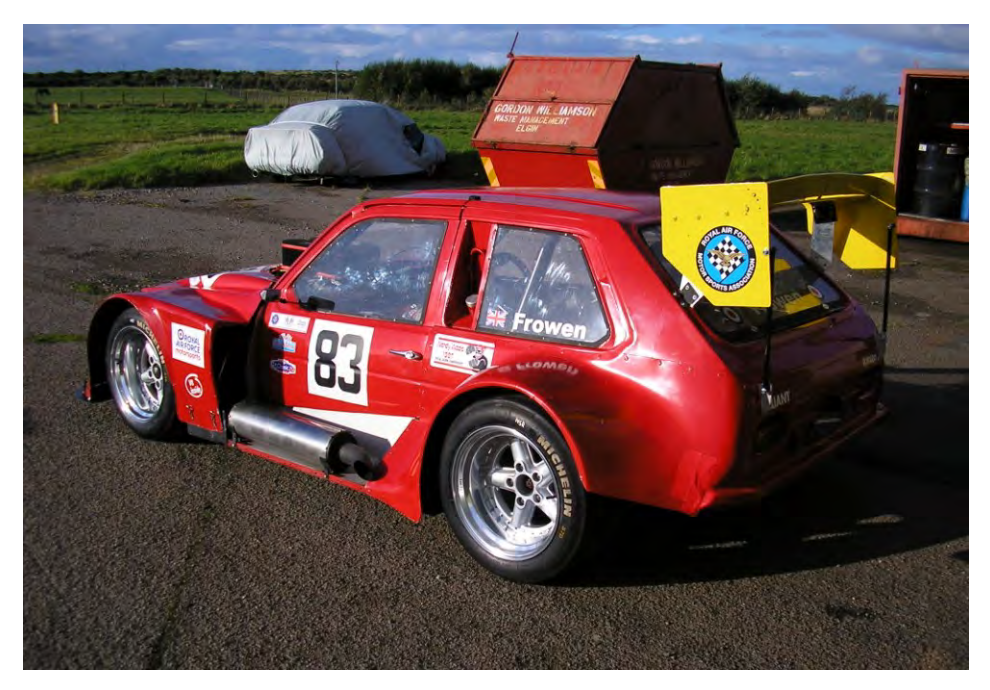
At least we have consistency!!