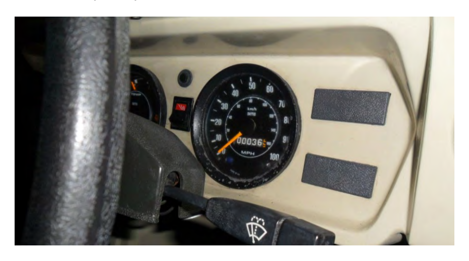
Yes, that is an average of about a mile a year!

While it had travelled a long way to be here, it had not actually covered very many miles in the decades since it was built!