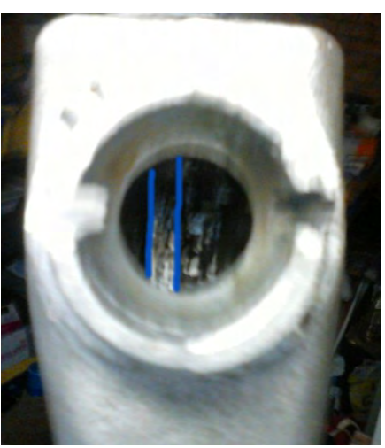
Above the rear of the extension shaft where the lever fits on the early Rebel gearbox.