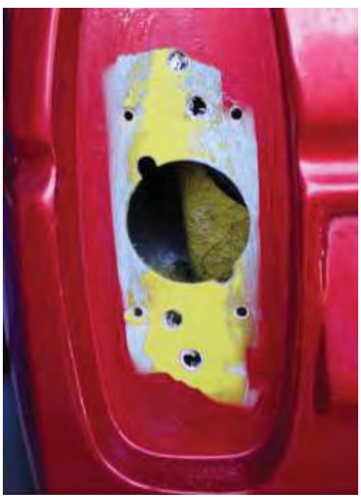
(My apologies for the colour difference, just a printing issue, the one on the right is closer to reality, not that colour matters in this instance. Ed!)

The cables were all taken through the original holes, but were found to be a little tight going through the large hole in the body panel, so cut-outs were filed to prevent them snagging. The light units were fastened to the body using M4 stainless steel screws and flanged nuts, then, with all the wires connected, we were ready for the big switch on.