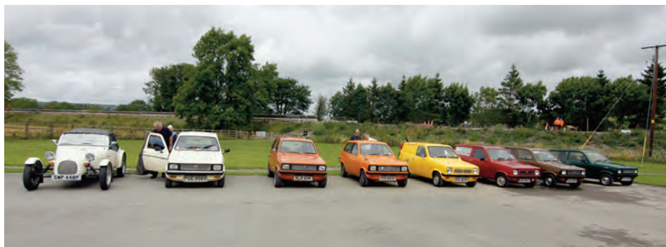
Here we are in the car-park next to the station on Saturday afternoon.