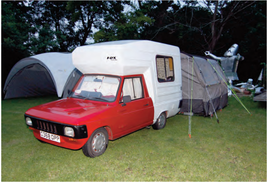
Three Tandys this year, and all different colours too!