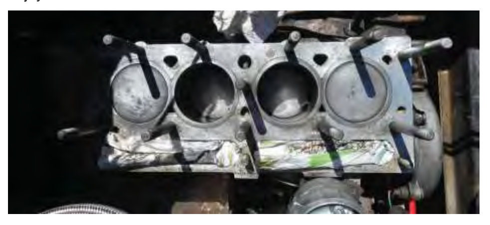
Bargain Hunter Strikes Gold.

cylinder head needed to come off; just what I need, now we're ready to enjoy the summer.