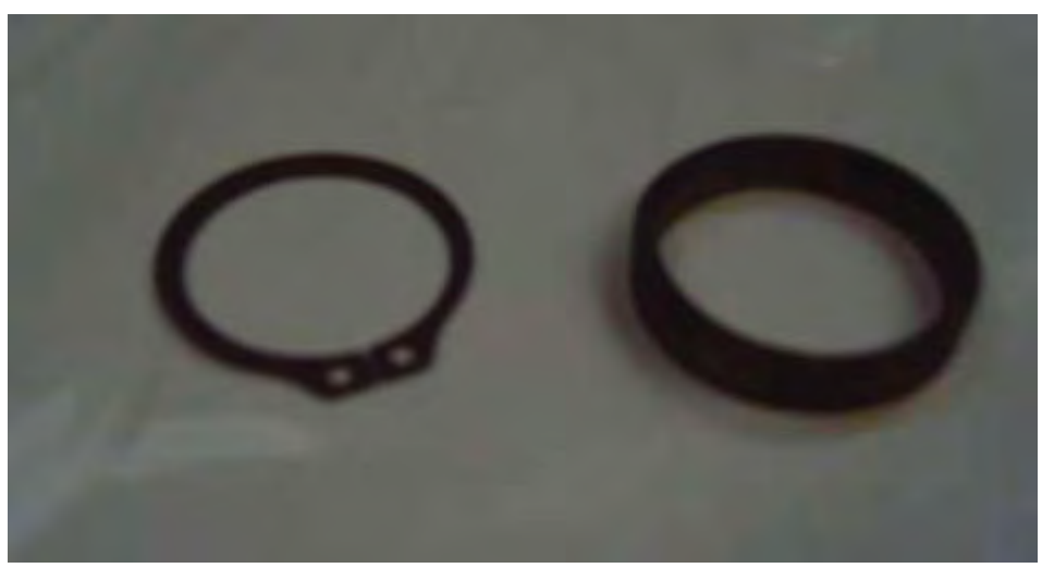
We have a batch of the spacers in stock.