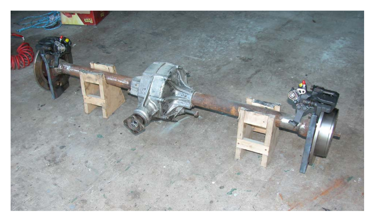
The whole thing?