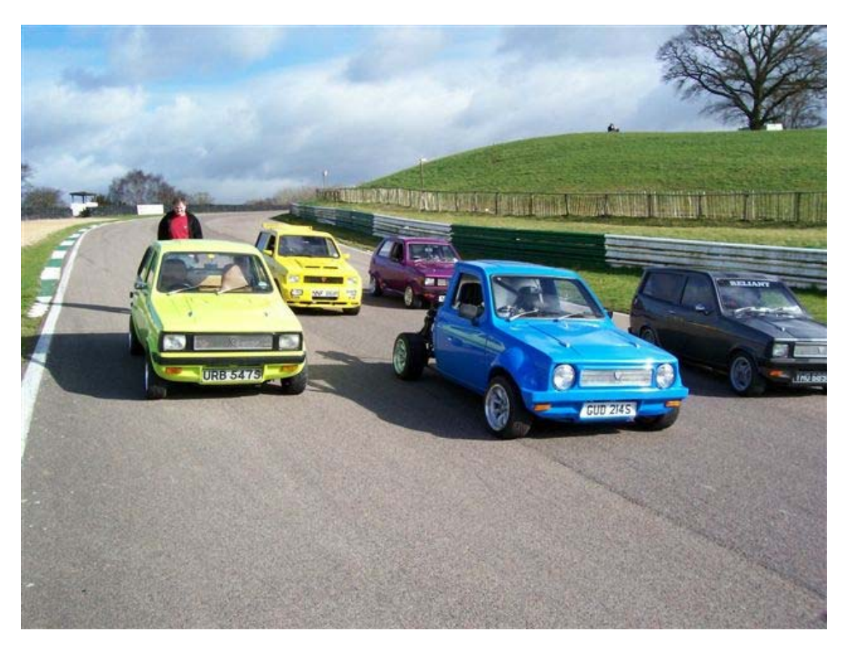
Feel free to propose a caption for what that man (is that you Steve?) is doing, surely they don't need a push start !?!