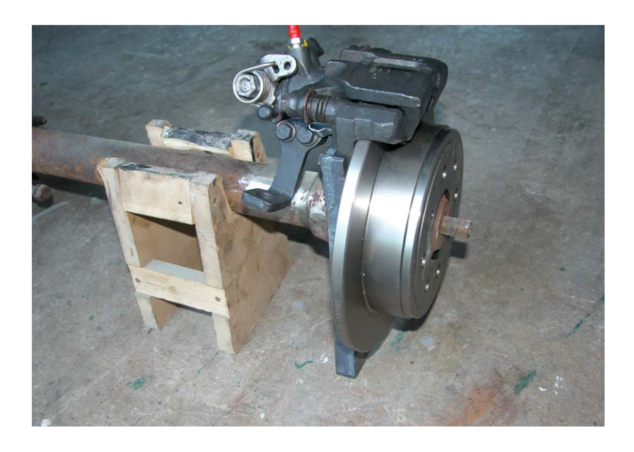
A close up of one side!