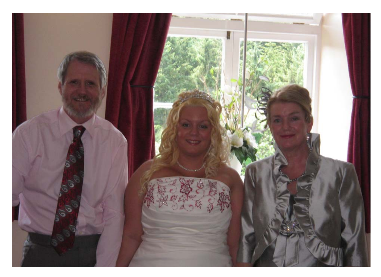
Right, normal service will be resumed, the sooner if you write to me!